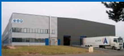
Logistic Building in NSE Vichy