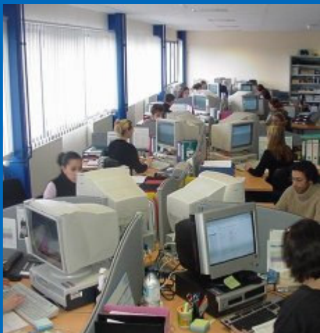
NSE : a customer service