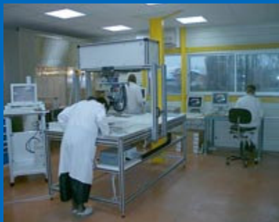
Laboratory LCD and PDP panels