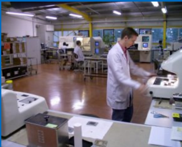
SMT with re-ball